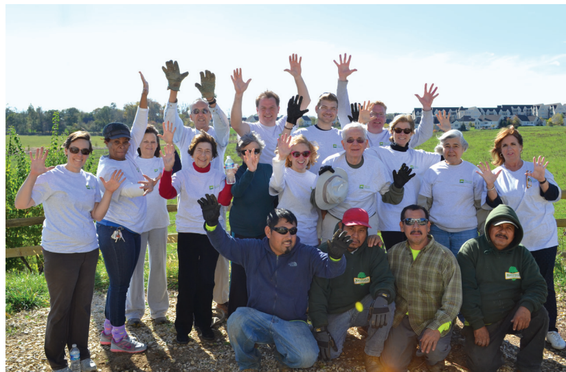
All hands on deck! Dedicated volunteers from The Hill at Whitemarsh, including staff, residents, and board members showed up in force to help clean up the grounds at the Dixon Meadow Preserve entrance before its opening to the public.